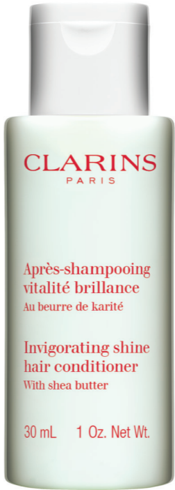
Invigorating shine hair conditioner This detangling conditioner gives shine and body to the hair, without weighing it down.