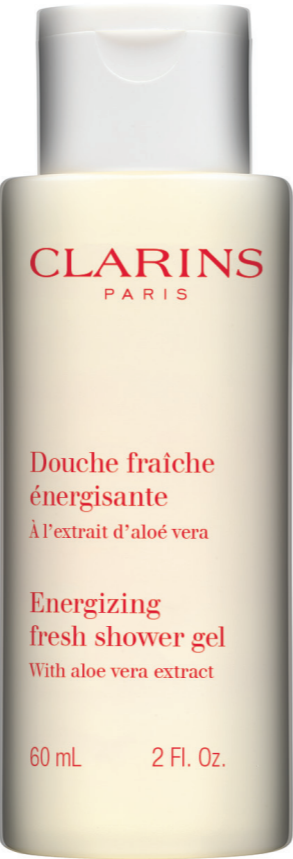
Energizing fresh shower gel Thoroughly cleanses and leaves the skin supple and soft.