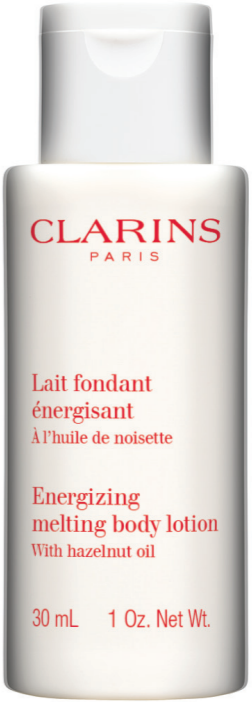
Energizing melting body lotion This fresh, non-oily lotion tones, moistures, polishes and helps to invigorate skin.