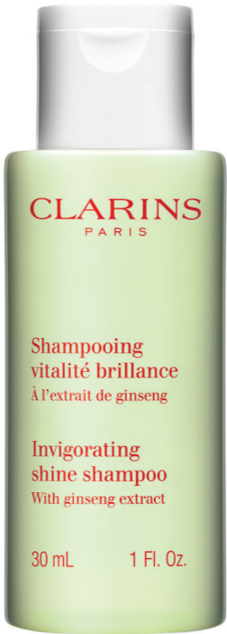
Invigorating shine shampoo Universal shampoo formulated to provide moisture, vitality and shine to the hair.